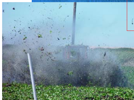
Mechanical “Cookie-Cutter” shown above attempting to cut a path thru the water hyacinth