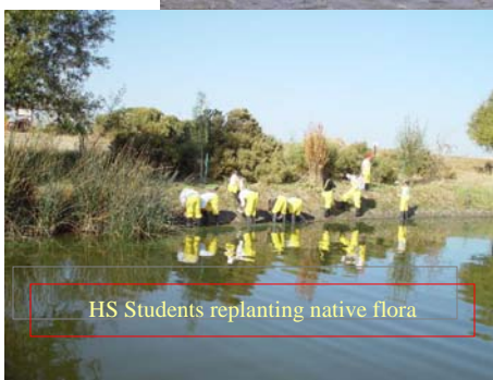
HS Students replanting native flora

So what is it that brings a dedicated team of Dow retirees/employees out to the wetlands nearly each Friday? Simply a love of nature and a dedication to community service.